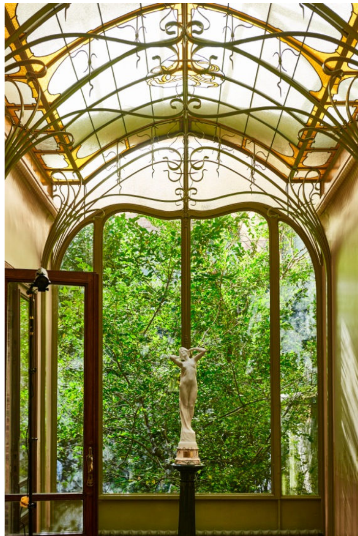
Winter garden Art Nouveau style architecture of the Museum.

As such it provides a poignant, albeit unintentional metaphor, an opposition of extremes: fluid organic art versus edgy urban constructions in which shadows it is wedged, a speck of humanity in the cogs of the towering machines all around.